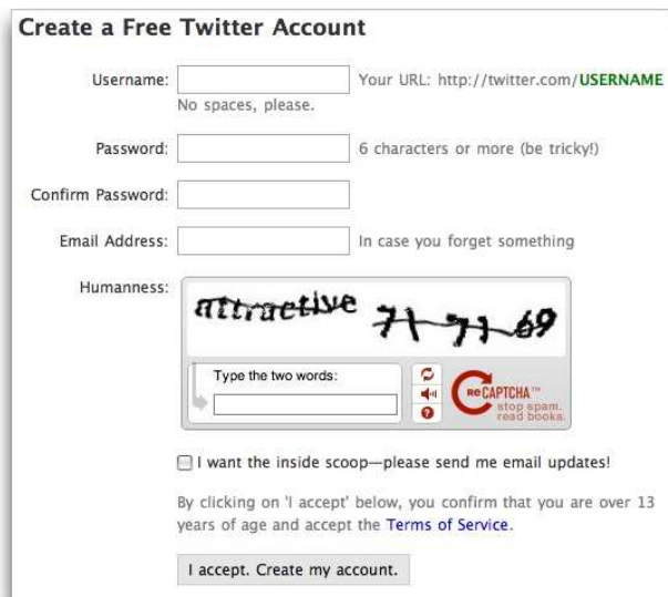
Example of Twitter sign-up page: